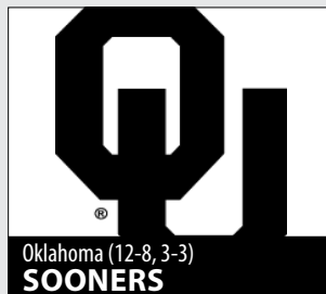
Oklahoma (12-8, 3-3)